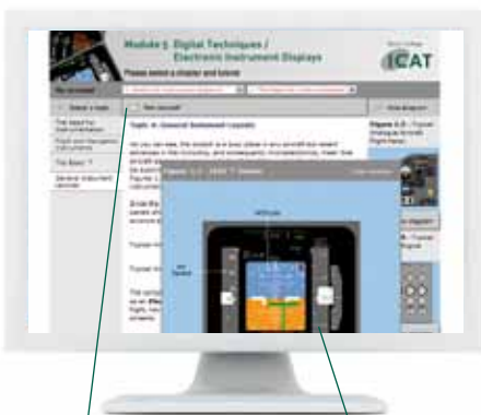
Interactive self-assessment questions

Study modules will be provided in an online format. The specially developed interface allows you to navigate quickly and easily to any part of the module. Text is clearly displayed in the centre of the screen. Interactive diagrams can be launched from the right-hand side of the interface or using the icon included in the text. To give you regular feedback on your progress, each module contains Self Assessment Questions (SAQs). You can set your own timetable around the way you live, but it doesn't mean that you are alone.